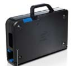
The Intel Portable Capture Station folds up for portability or storage